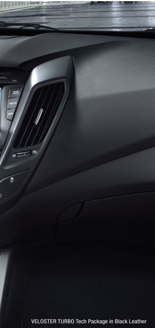
VELOSTER TURBO Tech Package in Black Leather