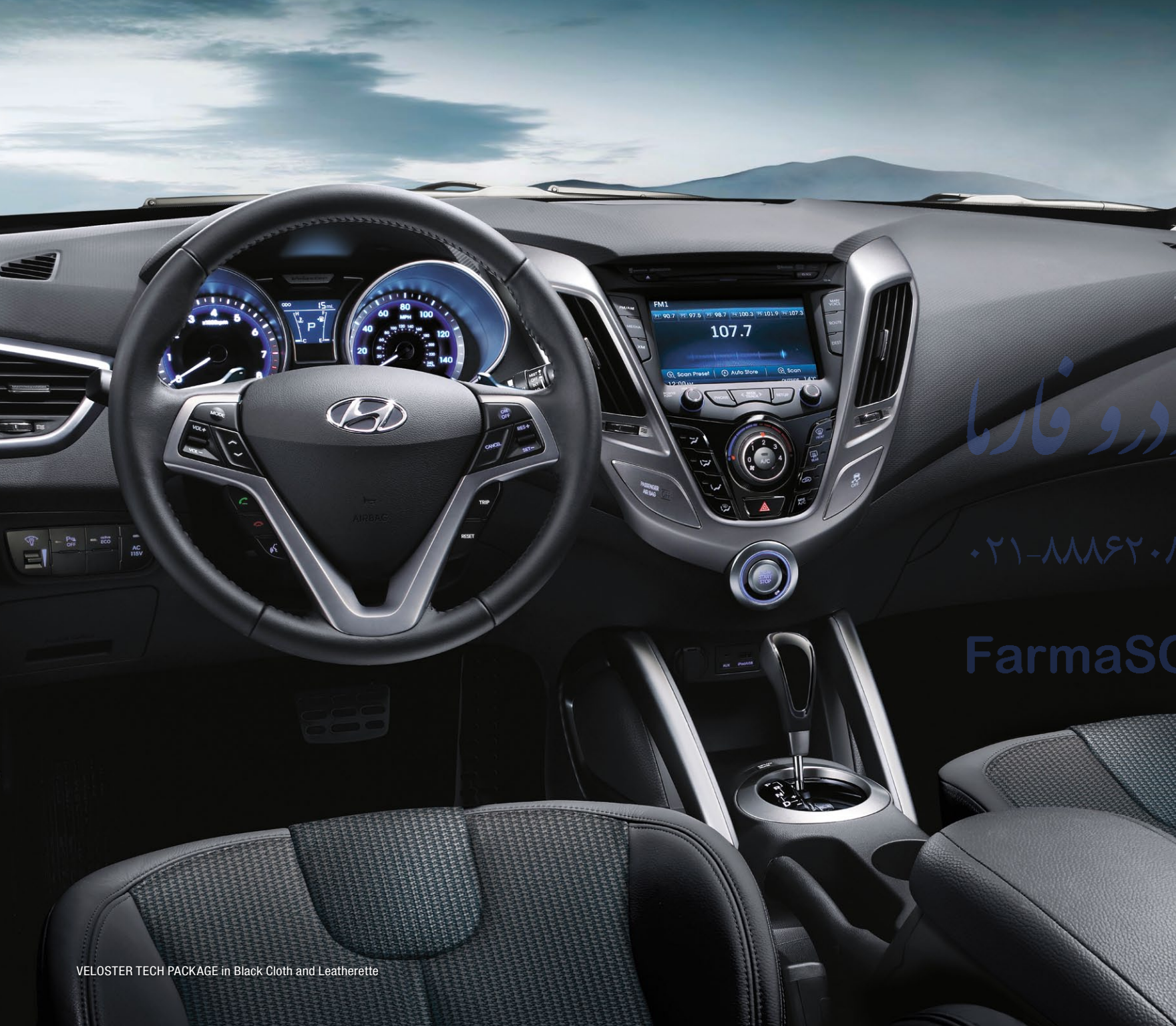
VELOSTER TECH PACKAGE in Black Cloth and Leatherette