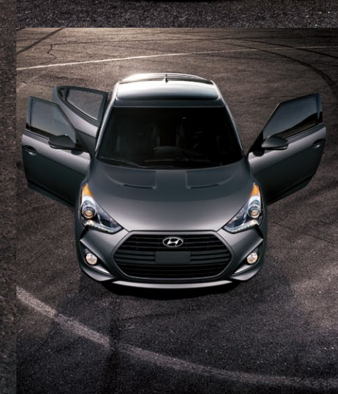
VELOSTER TURBO in Matte Gray