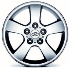
16-INCH GLS ALLOY WHEEL