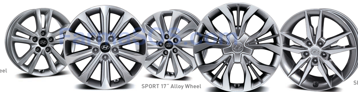
SE & ECO 16" Alloy Wheel