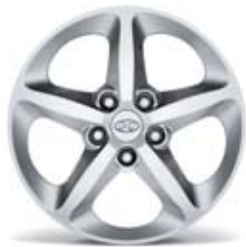
17-INCH SE/LIMITED ALLOY WHEEL