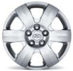
16-INCH GLS WHEEL COVER