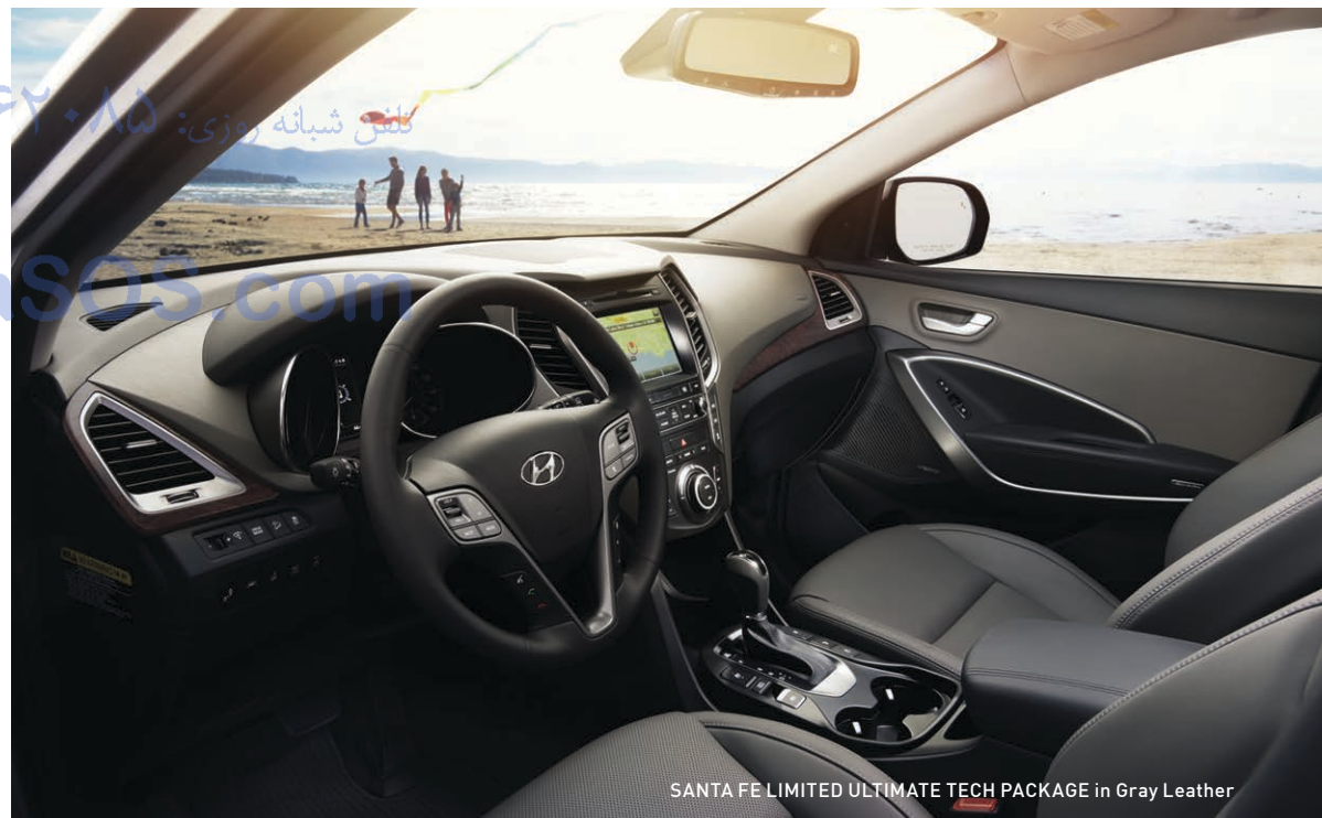
SANTA FE LIMITED ULTIMATE TECH PACKAGE in Gray Leather