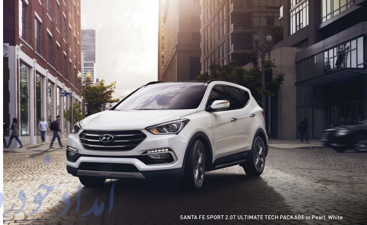
SANTA FE SPORT 2.0T ULTIMATE TECH PACKAGE in Pearl White