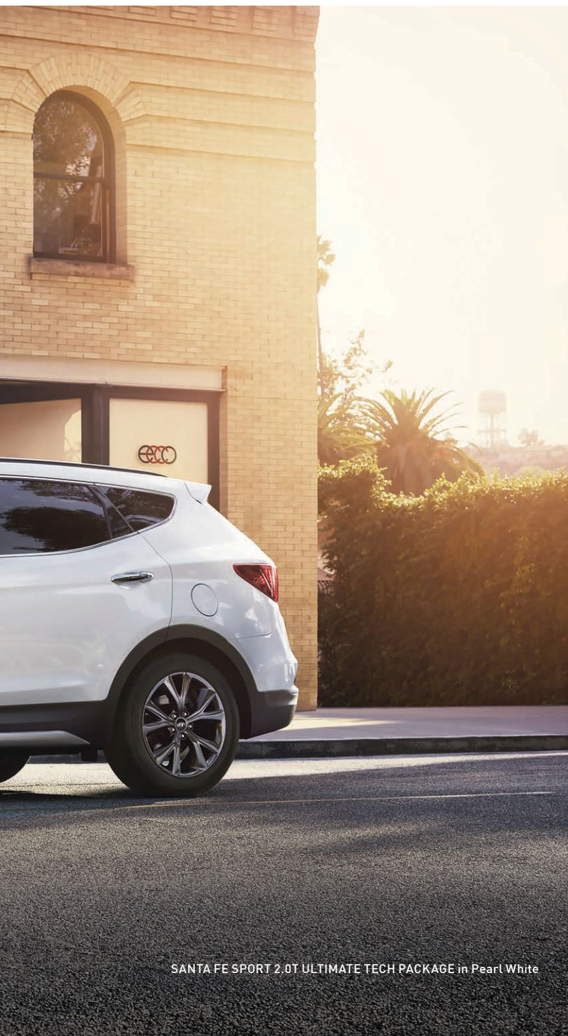
SANTA FE SPORT 2.0T ULTIMATE TECH PACKAGE in Pearl White