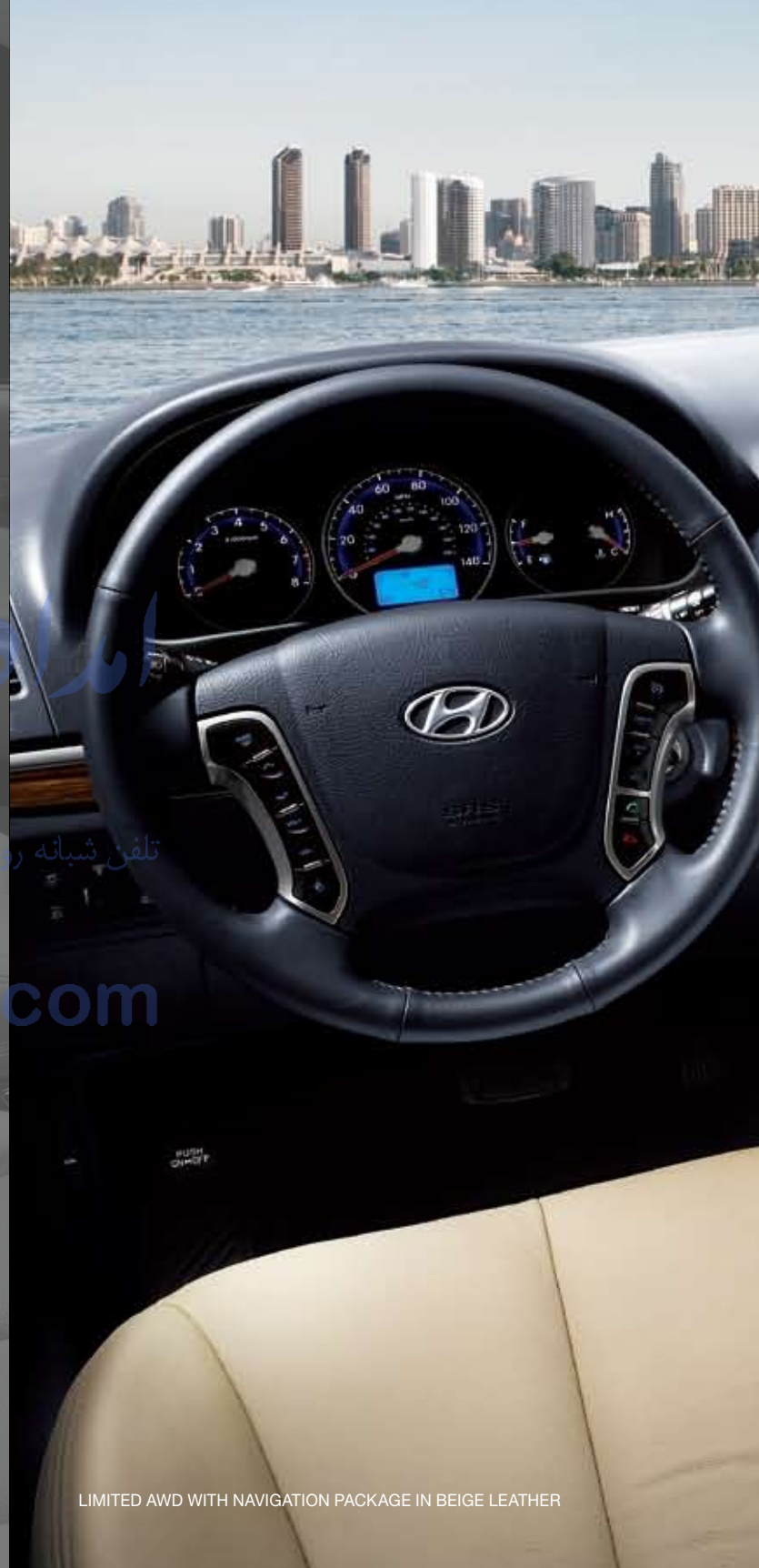
LIMITED AWD WITH NAVIGATION PACKAGE IN BEIGE LEATHER

Need to ferry 5-passengers? Haul home an estate-sale find? Santa Fe has the versatility your entire family needs.