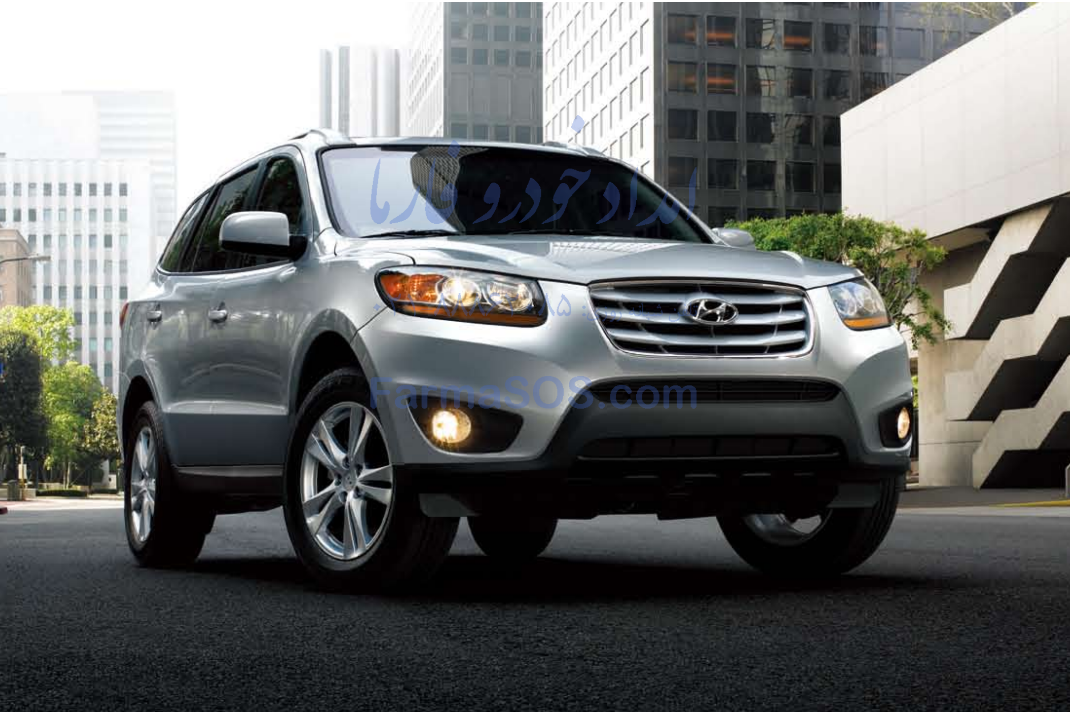
2010 HYUNDAI_SANTA FE