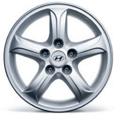
16-INCH GLS ALLOY WHEEL