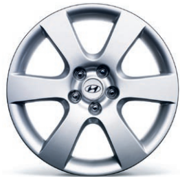
18-INCH SE/LIMITED ALLOY WHEEL