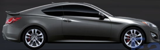
EMPIRE STATE GRAY