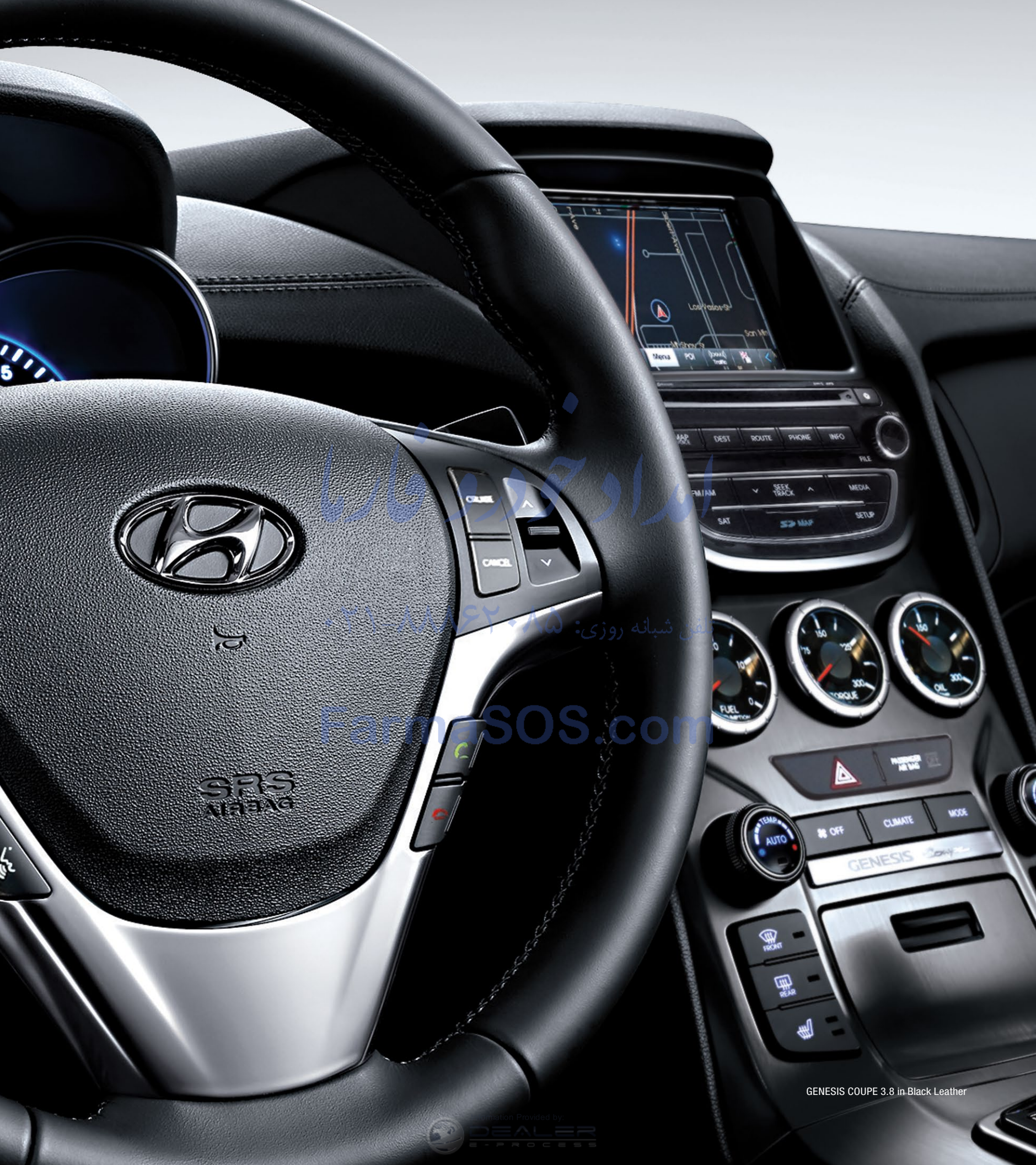
GENESIS COUPE 3.8 in Black Leather