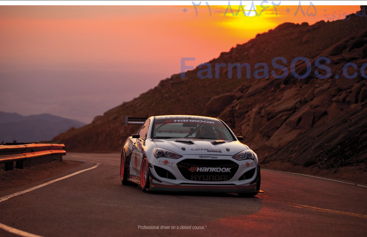
Professional driver on a closed course. 4

It's a testament to what lies at the core of Genesis Coupe: A sports car that superbly balances its powerful engine with precise handling. Look over the specs of our R-Spec or 3.8 Ultimate models, and you'll see how totally committed Hyundai is to offering exceptional levels of high performance, right off the showroom floor. You'll find Brembo® brakes, a Torsen® limited-slip differential, and a 6-speed manual transmission that adds carbon synchronizers for improved shift quality. 2 There's also engine speed-sensitive steering, with a 13.8:1 ratio that Car and Driver has described this way on our 2013 model: "Turn-in that's progressive and predictable, and its accuracy allows for confident placement in the corners and precise control in traffic." 3