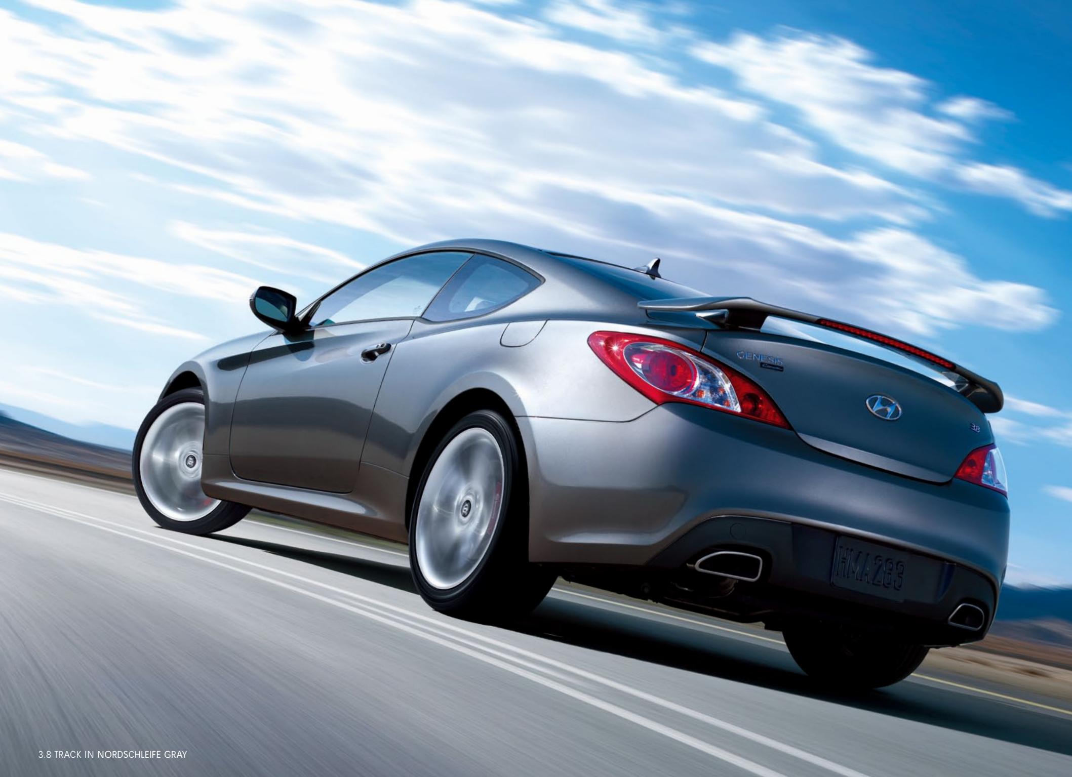
3.8 TRACK IN NORDSCHLEIFE GRAY