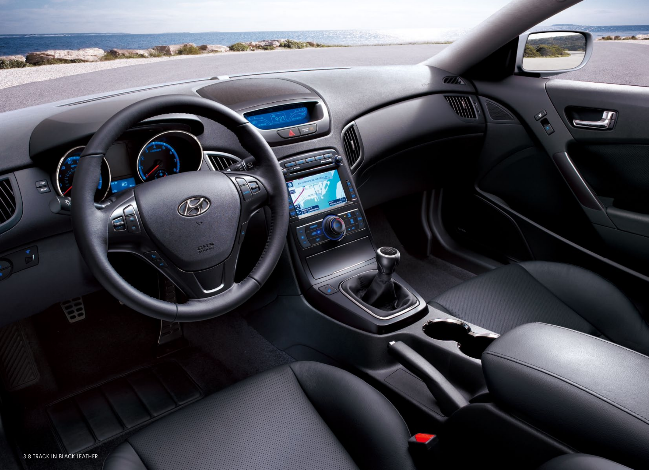
3.8 TRACK IN BLACK LEATHER