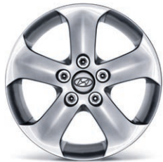
16-INCH SE ALLOY WHEEL