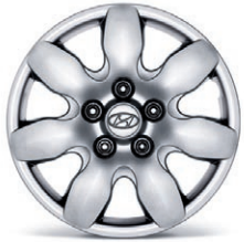
15-INCH GLS WHEEL COVER