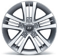
16-INCH GS ALLOY WHEEL