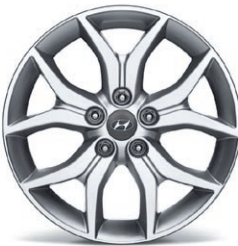
17-INCH GT/SE ALLOY WHEEL