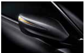
Power-Folding Side Mirrors with LED Turn Signal Indicators