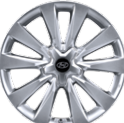
19" Alloy Wheel Limited