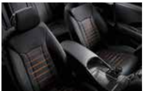
Heated Front and Rear Seats