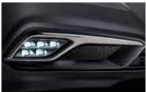
LED Fog Lights