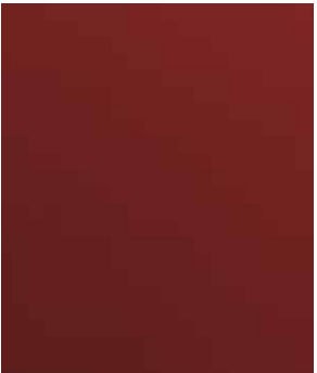
Venetian Red Pearl