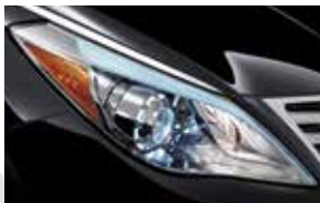
HID Xenon Headlights with Automatic High Beam Assist