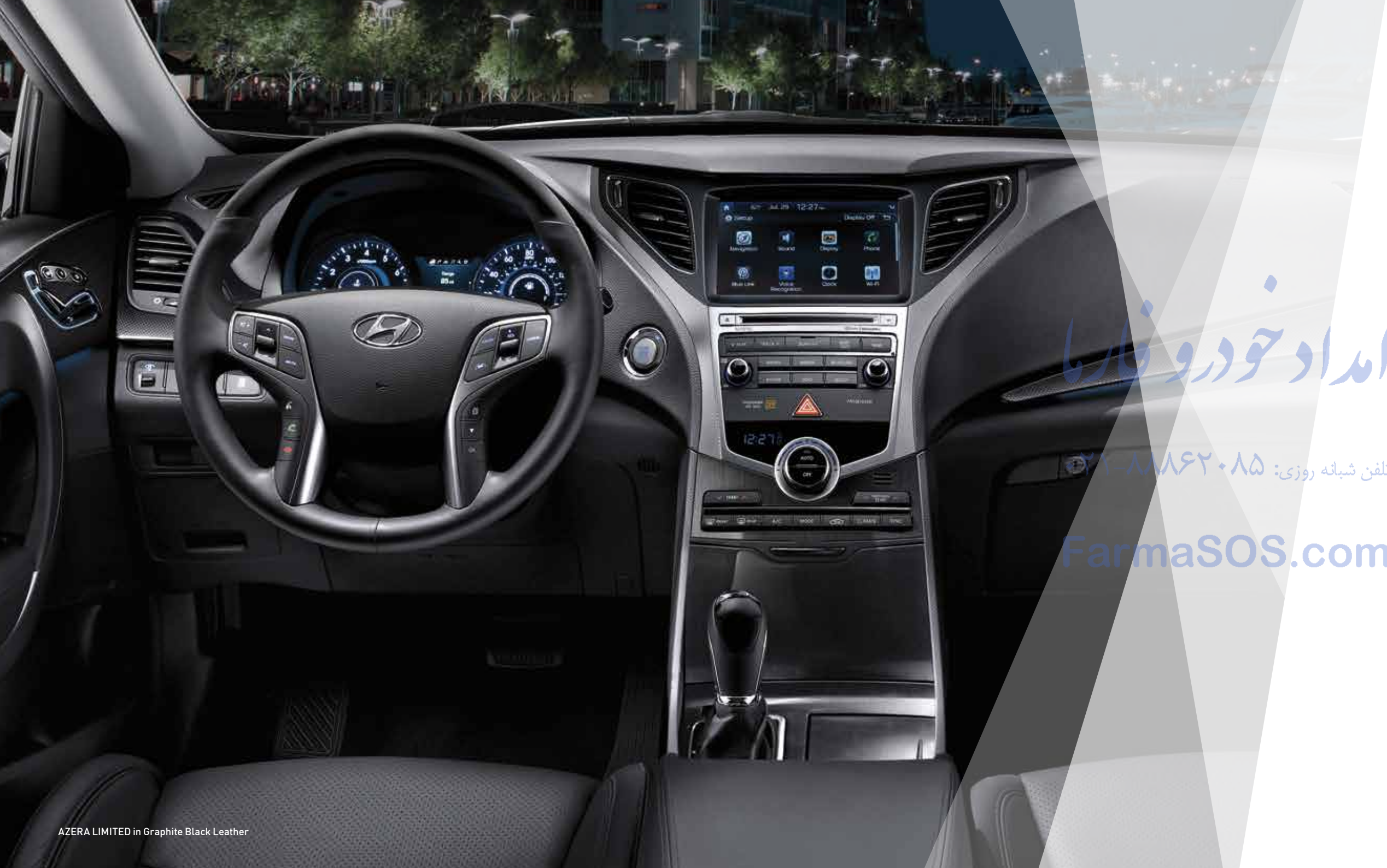
AZERA LIMITED in Graphite Black Leather