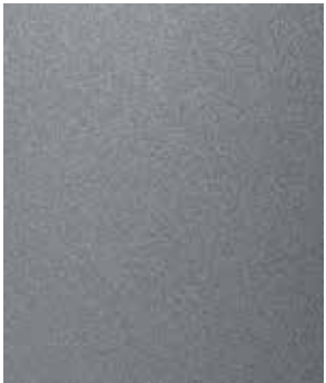
Pewter Gray Metallic