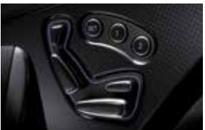
Integrated Memory System