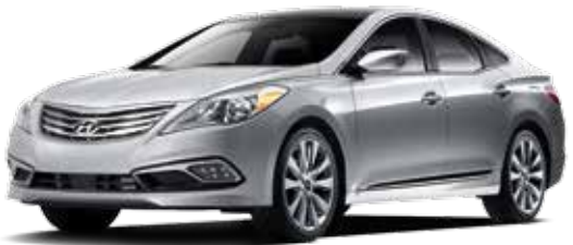
2016 AZERA LIMITED