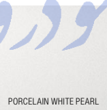
PORCELAIN WHITE PEARL