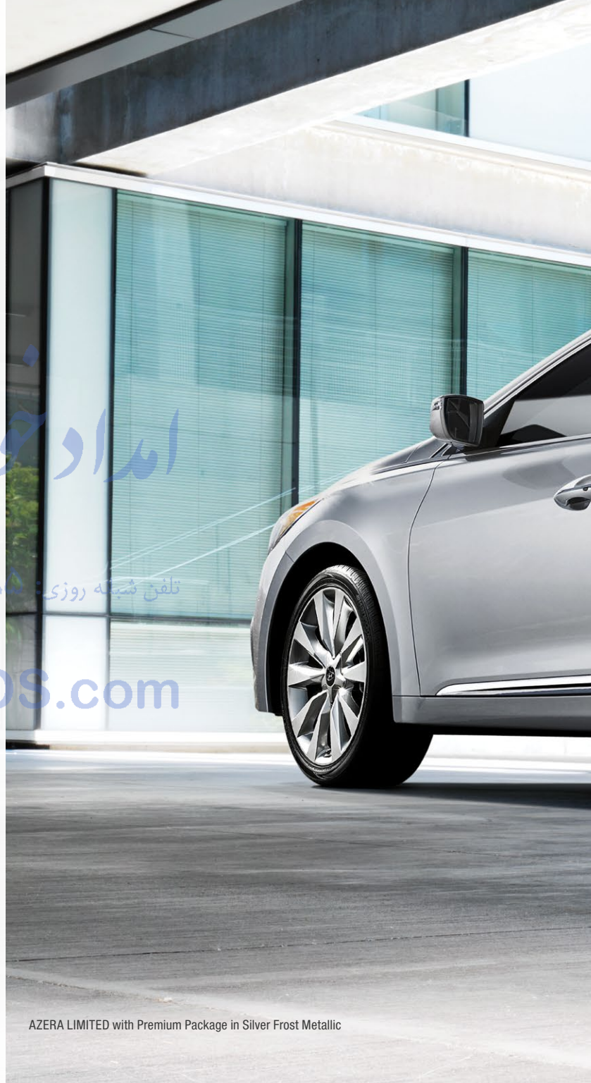
AZERA LIMITED with Premium Package in Silver Frost Metallic

The 2014 Hyundai Azera. It's one of those rare choices in life that doesn't require a compromise.