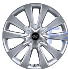
19" HYPER SILVER ALLOY WHEEL