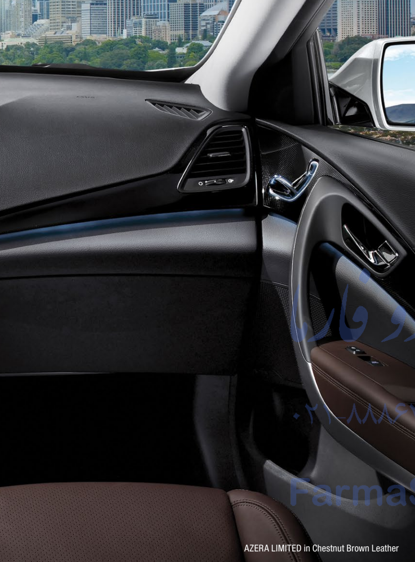
AZERA LIMITED in Chestnut Brown Leather