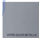
HYPER SILVER METALLIC