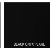
BLACK ONYX PEARL