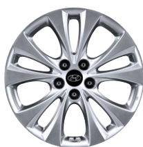
18" HYPER SILVER ALLOY WHEEL