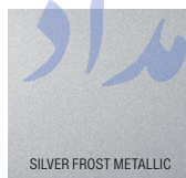
SILVER FROST METALLIC