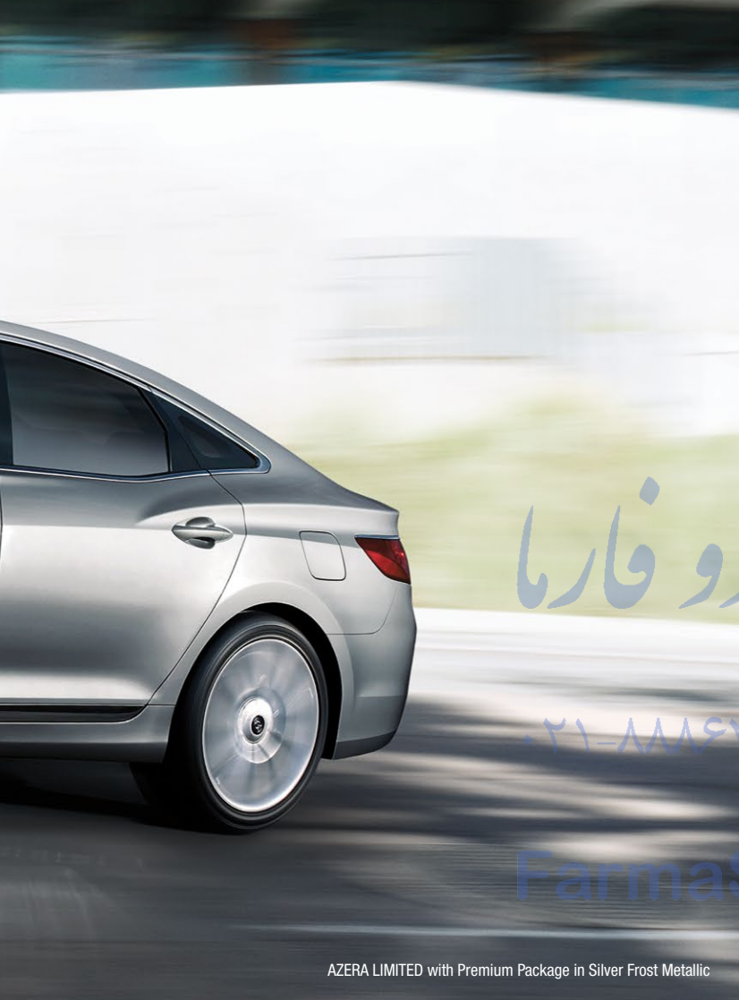
AZERA LIMITED with Premium Package in Silver Frost Metallic