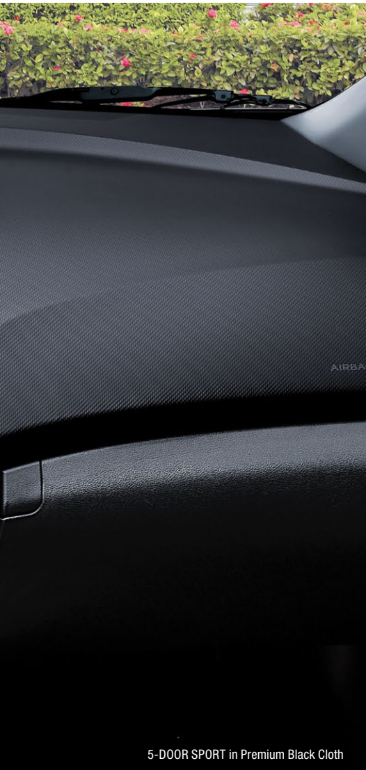
5-DOOR SPORT in Premium Black Cloth