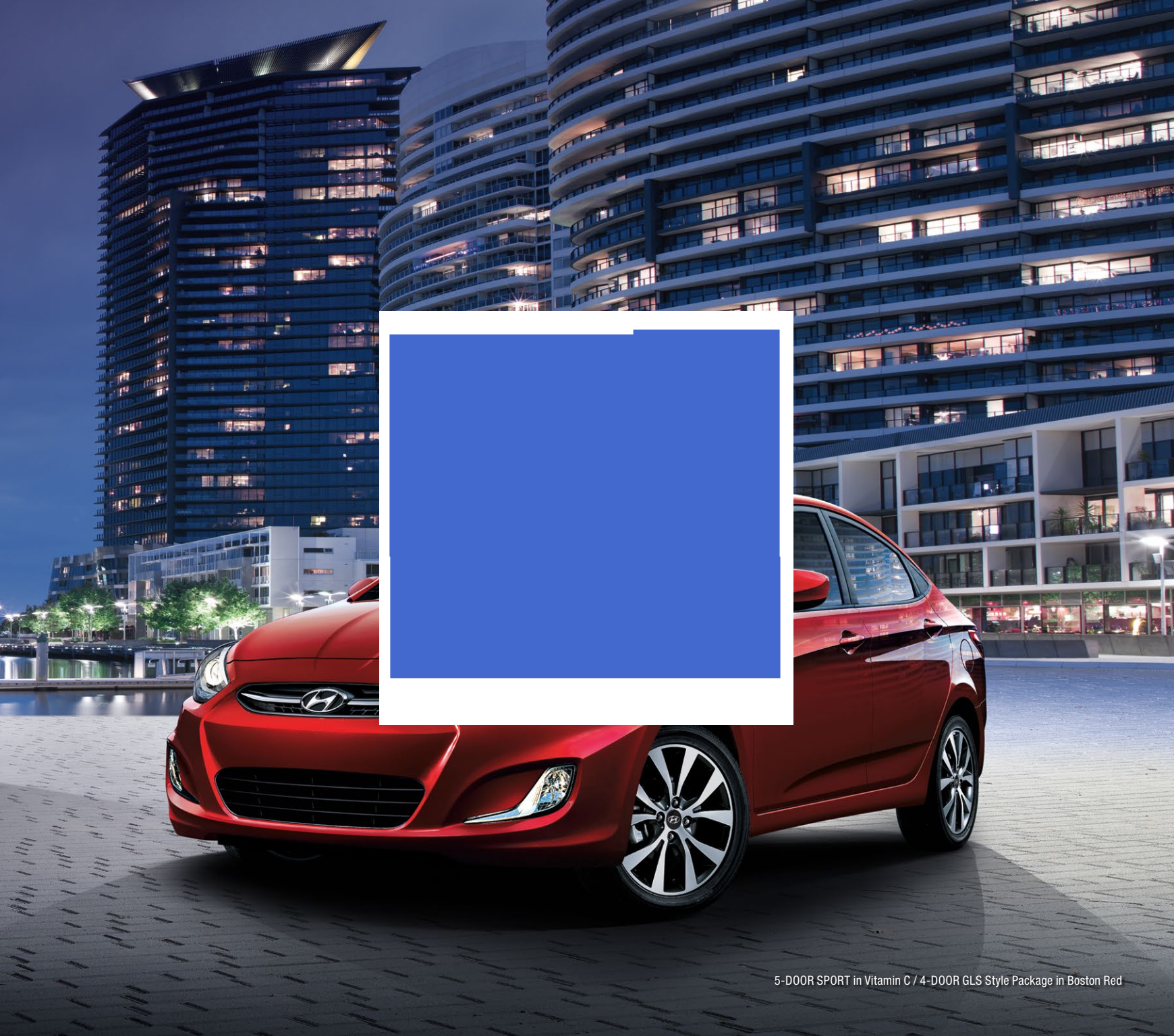
5-DOOR SPORT in Vitamin C / 4-DOOR GLS Style Package in Boston Red