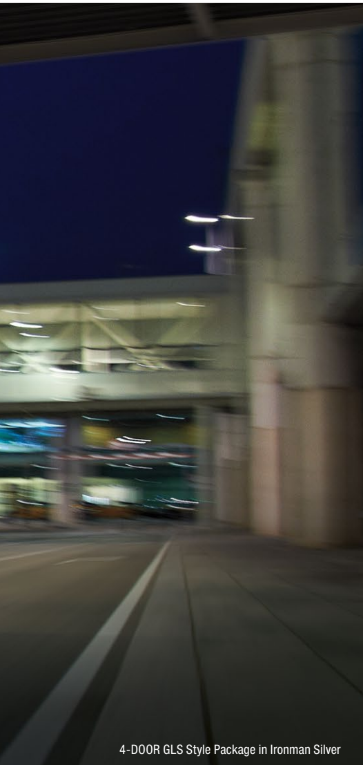
4-DOOR GLS Style Package in Ironman Silver