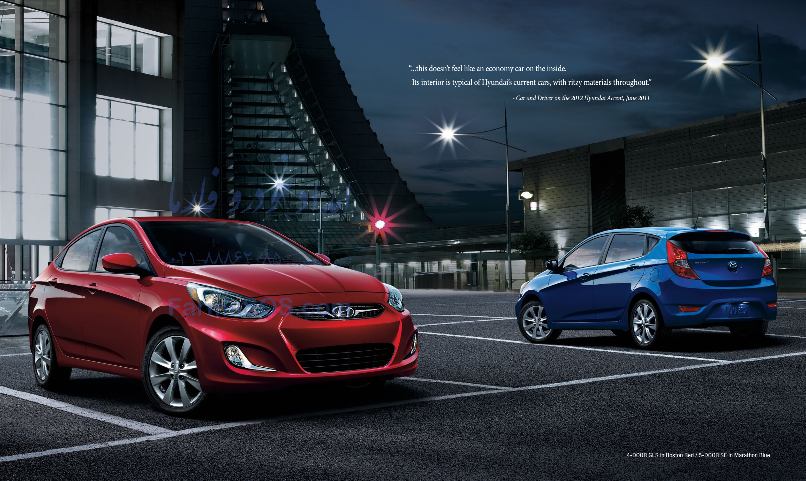
4-DOOR GLS in Boston Red / 5-DOOR SE in Marathon Blue

- Car and Driver on the 2012 Hyundai Accent, June 2011