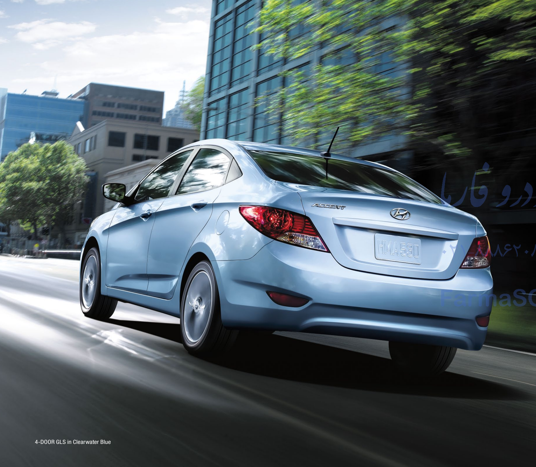
4-DOOR GLS in Clearwater Blue