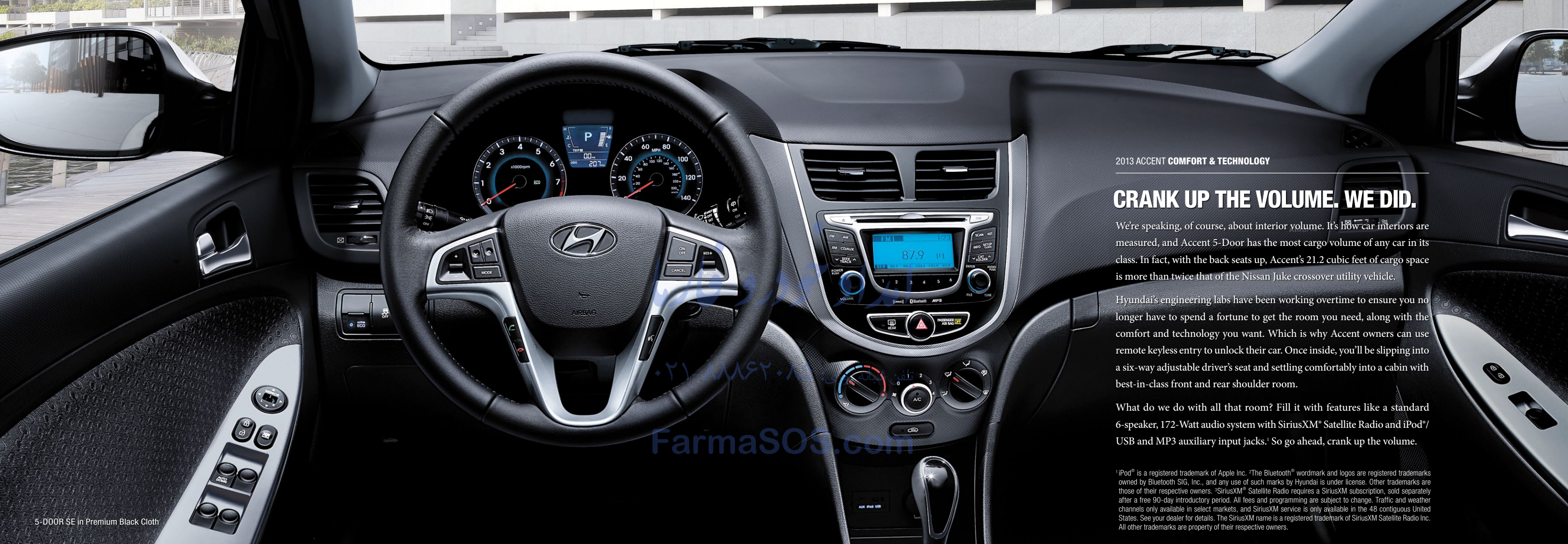
5-DOOR SE in Premium Black Cloth